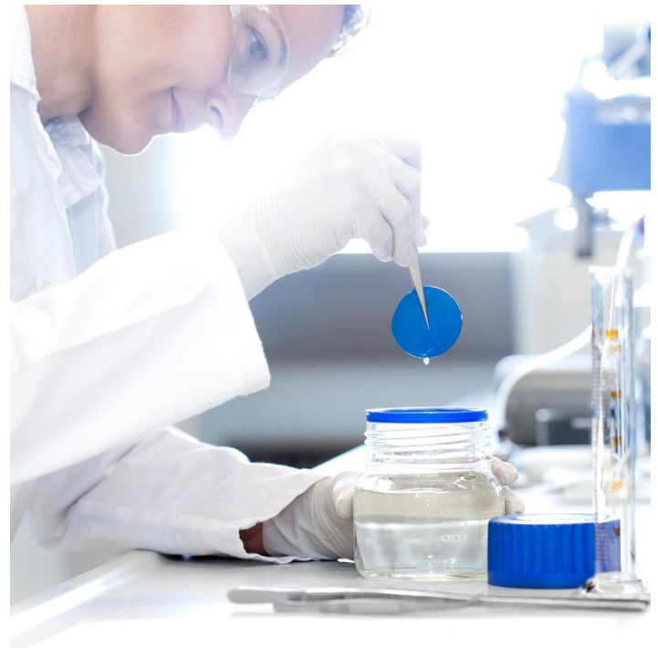
The test at the Semperit laboratory confirmed the excellent chemical resistance of the new LMD NBR hose.